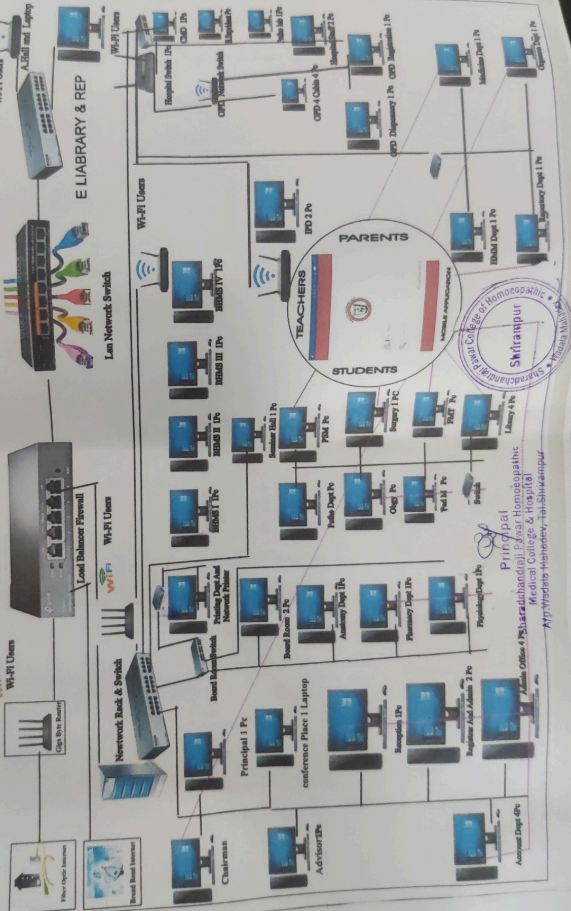
E-GOVERNANCE ARCHITECTURE DIAGRAM